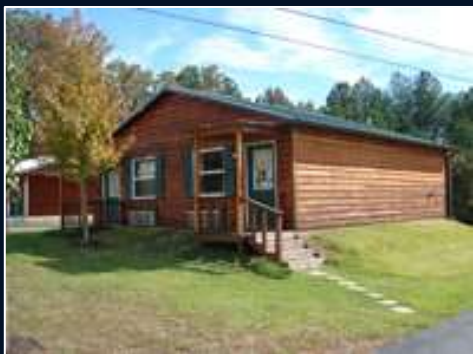
Fishtale Lodge 14275 Hwy 79 N. Buchanan, TN 731-642-7113 www.FishTaleLodge.com

It is always a very busy time in Paris, so please make your reservations as soon as possible to guarantee lodging. Below are a few recommended hotels.