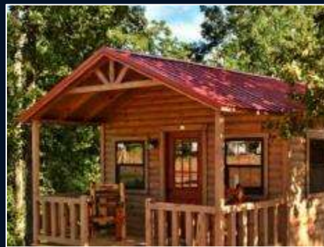
Swan Bay Cabins & RV Park 226 Swan Bay Rd Buchanan, TN 38222 931-444-0941 www.SwanBayCabinsRVPark.com

For more lodging options, check out fishkentuckylake.com/lodging/ .