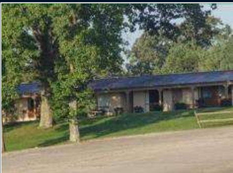
Buchanan Resort 785 Buchanan Resort Rd. Springville, TN 38256 731-642-2828 www.BuchananResort.com *Camping options also available.

It is always a very busy time in Paris, so please make your reservations as soon as possible to guarantee lodging. Below are a few recommended hotels.